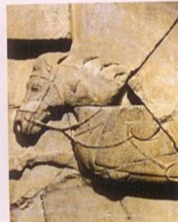
Relief sculpture of six horses in the Zhaoqing Mausoleum

Xi'an is a top tourist city of China, and a well-known tourist destination in the world, due to its abundant tourism resources. Its precious relics and historical sites, well preserved, can be found all over the city, ranking first in the world in the number, level, distribution and density. The terracotta warriors and horses of the Qin Dynasty, which are included in the list of the world cultural heritages, are known as the "eighth wonder in the world"; the towering Greater and Lesser Wild Goose pagodas date back to the Tang Dynasty; the Drum and Bell towers have experienced many vicissitudes of life; and the mag-