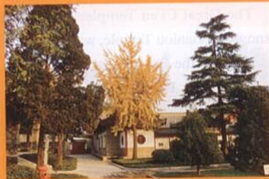
Trees grow luxuriantly at the Great Ci'en Temple

rated with beautifully carved patterns, featuring well-arranged pictures and strong lines, which are important data for the study of China's ancient architecture. The pagoda is square inside too. Visitors may climb up a spiral staircase inside the pagoda to its top and enjoy a panoramic view of the southern suburbs of Xi'an. On both side of the south entrance of pagoda, there are two tablets engraved with the calligraphy of Chu Sui liang, a famous Tang Dynasty calligrapher, from the inscriptions by the Tang emperors—"Preface to the Sacred Tripitaka of the Tang Dynasty" by Li Shiming (Emperor Taizhong) and "Notes for the Preface to the Sacred Tripitaka of the Tang Dynasty" by Li Zhi (Emperor Gaozong).