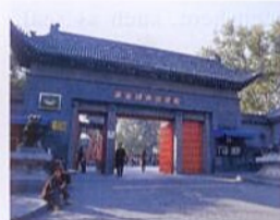
The front gate of the Stele Forest

After the founding of the People's Republic of China, the Stele Forest Museum was set up on the old site, with an area of 31,900 square meters, including 4,900 square meters of exhibition rooms. This museum mainly consists of three parts—the history exhibition halls, stele forest and stone carving art rooms—and houses more than 11,000 cultural relics, including over 3,000 pieces on display in 11 exhibition halls, and 134 national cultural relics which fall into 19 types (groups). Hence the Stele Forest Museum has been known as the largest indoor museum of steles and the richest treasure house of calligraphic art in China. The museum now holds more than 2,300 tablets with inscriptions ranging from the Han to the