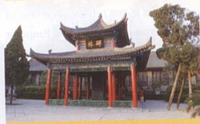
A memorial archway at the Stele Forest