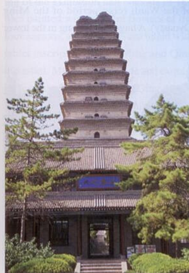
Lesser Wild Goose Pagoda

Dynasty, went to India to study Buddhism. After returning home, he came to the Jianfu Temple, devoting himself to translating Buddhist scriptures. He translated 56 Buddhist scriptures altogether, and wrote a book The Biography of a Tang Monk Who Went to the Western Regions for Scriptures , which is of great value to the study of the cultural exchanges between China and India. The most cultural relics in the temple are tablets with inscriptions, including 43 since the Tang Dynasty, of which "Bodhisattva attendant" is a rare cultural relic of the Tang. The temple also houses more than 100,000 copies of ancient books, including over 200 types of rare ones. 10 ancient trees, such as a 1,000-year-old Chinese scholar tree also can be found in the temple. After being renovated in an all-round way, the temple looks more magnificent now, with spacious halls and beautiful courtyards.