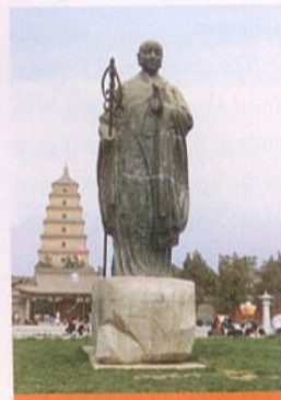
Statue of Xuan Zang

The Great Ci'en Temple, originally known as Tianlou Temple, was first constructed in the Sui Dynasty (581-618). When Li Zhi, Emperor Gaozong of the Tang Dynasty, was the crown prince, he had the temple renovated to commemorate his mother Empress Wende. In the Tang Dynasty, the temple was grand and gorgeous, including many buildings, pavilions, meditation rooms and over 10 courtyards. Eminent Monk Xuan Zang of the Tang Dynasty translated scriptures in Dadong Yard, and founded Ci'en Sect, an important sect of Chinese Buddhism. Hence the temple enjoyed a high reputation in the country then. After the Tang