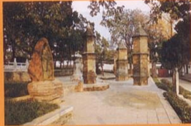
Inside the Great Ci'en Temple