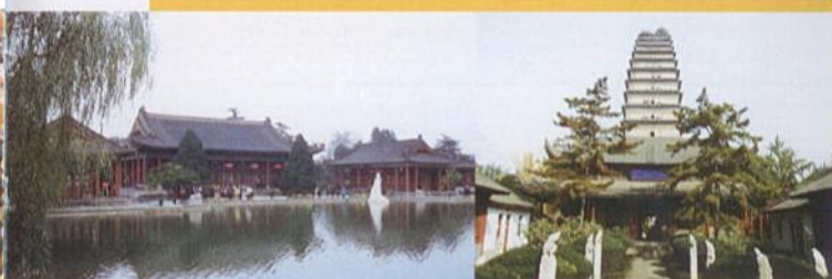
Lesser Wild Goose Pagoda