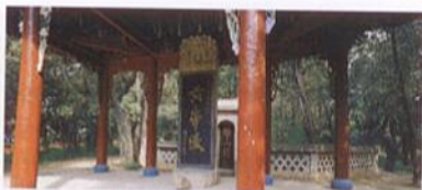
Mausoleum of Yellow Emperor

At the top of Qiaoshan Hill, one kilometer north of Huangling County, it is the cemetery of Xuanyuan, the founder of the Chinese nation. Yellow Emperor, whose surname is Gongsun, styled himself Xuanyuan as he lived on Xuanyuan Hill. He defeated Emperor Yan Di at Banquan, killed Chiyou after a long and fierce battle at Zhuolu, and