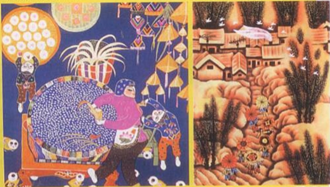
Huxian farmer paintings

The Xi'an City Wall International Marathon Friendship Race is held on the city wall in November every year, including 5,000-meter, 10,000-meter and half-distance races for men and women. Attendants are foreign tourists, foreign organizations, delegations of friendship cities and local residents. This annual race expresses the good wish of Xi'an people for international exchanges.