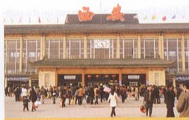
Xi'an Railway Station

on special routes do not have conductors, so passengers need to prepare changes before getting on such a bus.