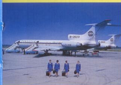
Aviation of Xi'an