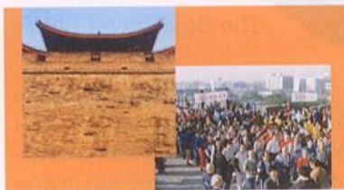
Xi'an City Wall International Marathon Friendship Race