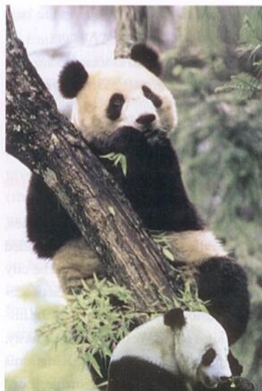
Giant pandas at Foping

County, the Foping Giant Panda Nature Reserve was set up for protecting giant pandas, with an area of 350 square kilometers. Now the nature reserve mainly includes Daguping and Yueba, in addition to the Hall of Giant Pandas Specimens and a domestication farm in Sanguanmiao.