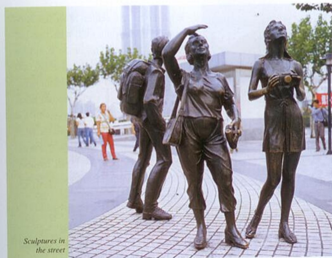
Sculptures in the street