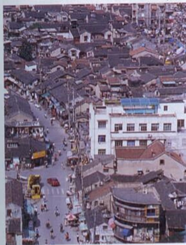
The old city area

Shanghai's southern old city area refers to the place extending from Shiliupu to Gaochangmiao, compared to the northern city area which had been concession once. The city wall in southern old city area was first built in the 32nd year (1533) during the reign of Jiajing in the Ming Dynasty. It is 4.5 km long and 8 m high with 6 gates. Between 1912 and 1914 the whole city wall was pulled down except the Dajingge section. Yet the old city area is not without its antique elegance and beauty. The Shikumen residential buildings built in the 1870s takes up an important position in