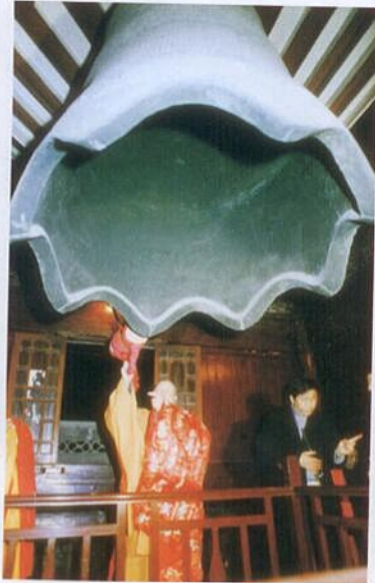
Longhua Evening Bell

Longhua Temple Fair enjoys the longest history and is of the largest scale among all the folk festivals in east China. It is held in Longhua Temple in the late April every year. During the temple fair, Longhua Temple is filled with Buddhist music and pilgrims. The old Longhua Town is also bustling with activity at the time. Visitors can taste all kinds of local snacks and enjoy folk art performances.