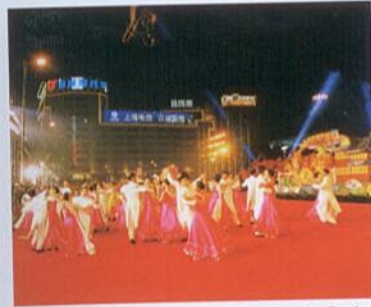
Shanghai Tourism Festival