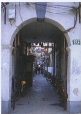
Old residential area

Shanghai architectural history, and reflects ordinary people's lifestyle very well. Its design derives from traditional Chinese courtyard house and European row house. Looking from outside, the whole building is completely separated from the outside world, just like a warehouse. With its gate made up of stone, it gets the name "Shikumen".