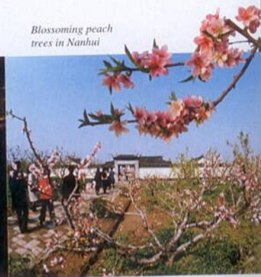
Blossoming peach trees in Nanhui

The first Nanhui Peach Blossom Festival was held in 1991. Since 2002 the festival has been held annually between March and April in Nanhui District. The purpose of holding the festival is to display the beautiful rural scenery and demonstrate the prospects of the country-