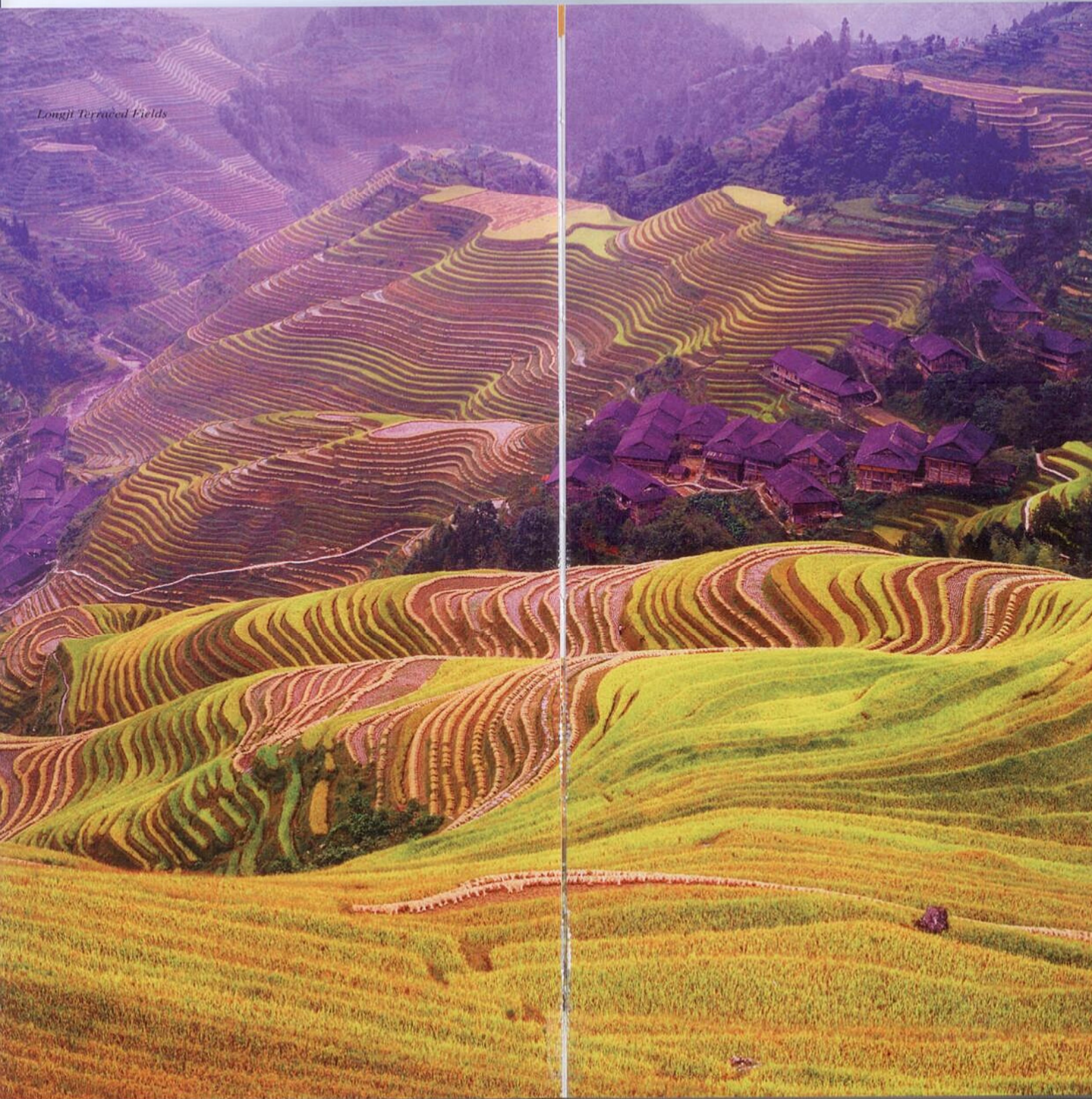
Longji Terraced Fields