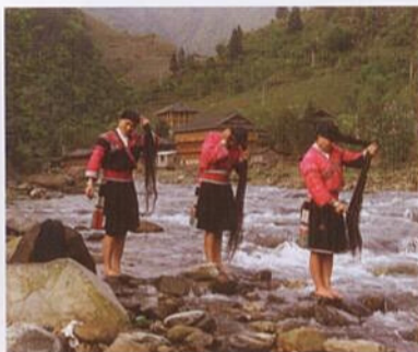
Long hair competition - a custom in Longsheng