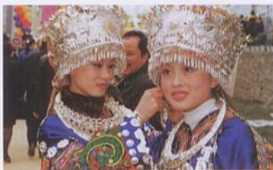
Miao girls in their holiday best

in the seventh lunar month every year, all the ethnic minority people float lanterns (paper boats with lit candles) on the Ziyang River. When floating lanterns on the river, the people on both banks sing folk songs to recall the past events, express feelings, tell stories or give comments. It is the river-lantern festival. During the festival, the county seat is crowded with people in various ethnic clothes from far and near. They perform dragon and lion dances, play local operas, do shopping, sell mountain products, sing songs and look for lovers, enjoying themselves to their hearts content. The people in Ziyuan County have celebrated the River-lantern Festival for nearly 400 years. In recent years, the festival has attracted a large number of domestic and foreign tourists.