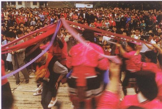
Red Clothes Festival