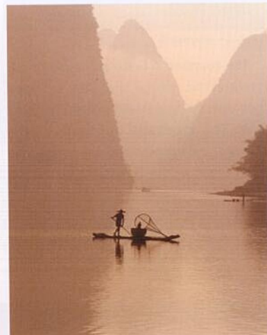
Fish in the Lijiang River in the morning

Though Guilin serves a wide variety of delicious foods from all over the country, the local people are keen on rice noodles. Everyday, several hundred thousand local people in Guilin eat rice noodles for breakfast, and some people even take rice noodles as orthodox and convenient dinners. More often than not, the Guilin people would formally introduce rice noodles to their friends from afar. It is a common understanding in Guilin that those who have not eaten rice noodles cannot say they have been to Guilin. If you want to have a good understanding of the lifestyle of the Guilin people, you'd better go to the rice noodle restaurants in the early morning, where you may see how the local people eat rice noodles with various kinds of toppings, such as pot-stewed meat, vegetables and tender sirloin.