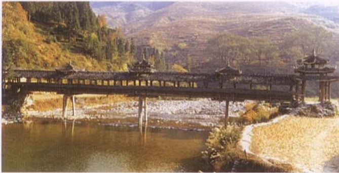
A wind-and-rain bridge of the Dong People