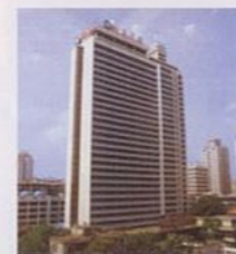
White Cloud Hotel