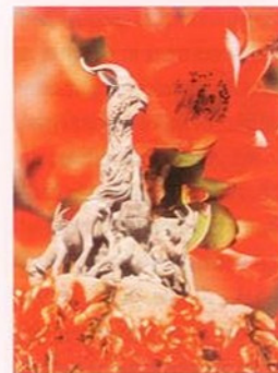
The Sculpture of Five Rams

Winter (Mid-December to late February): Somewhat cold. Sometimes tourists need to wear overcoats. Temperature averages 17°C, with humidity 72%.