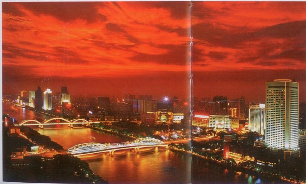
Pearl River at night