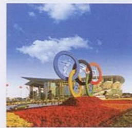
Guangdong Olympic Stadium

Guangzhou is a world-renowned tourist city, attracting travelers from both within and out of China with its long and brilliant history, haunting landscape and unique and splendid culture.