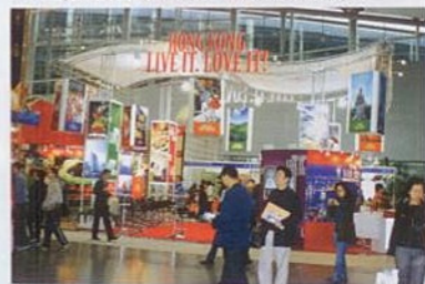
Guangzhou International Travel Fair

Initiated in 1993, Guangzhou International Travel Fair is one of the key complex and large-scale international travel fairs in China. Nowadays, it has grown into an important platform for tourism industry in exchange, presentations and marketing. Moreover, it has exerted extensive influence upon the tourism industry and related industries at home and abroad. It has been reputed by domestic and foreign customers for one of the most important significant annual international travel exhibitions in the Asian-Pacific Region. In brief, the fair provides the best venue for people from tourism industry to find the latest market information and seek for business opportunities.