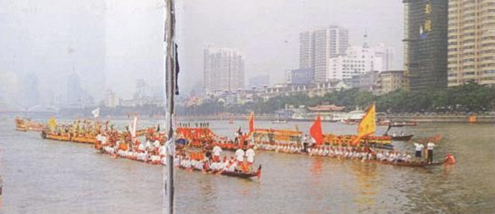
Guangzhou International Dragon Boat Tournament