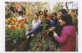
Flower Fair on Xihu Road, Yuexiu District

nese traditional festival which is held on the fifteenth evening of the first lunar month. Yuan xiao is a kind of sweet dumplings made of glutinous rice flour. Yuan xiao deng hui is a show in which lanterns and various color lights are exhibited and sold during the Spring Festival. Lantern shows from Zigong of Sichuan and Datong of Shanxi are usually put on in Yuexiu Park,