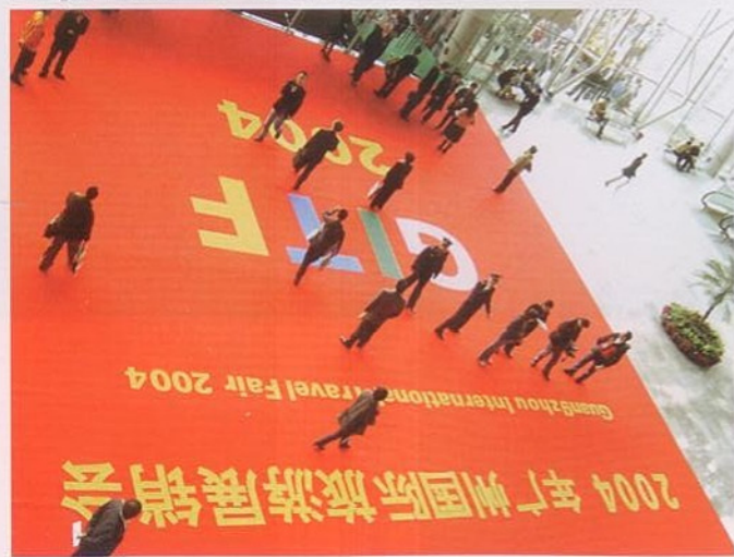
Guangzhou International Travel Fair