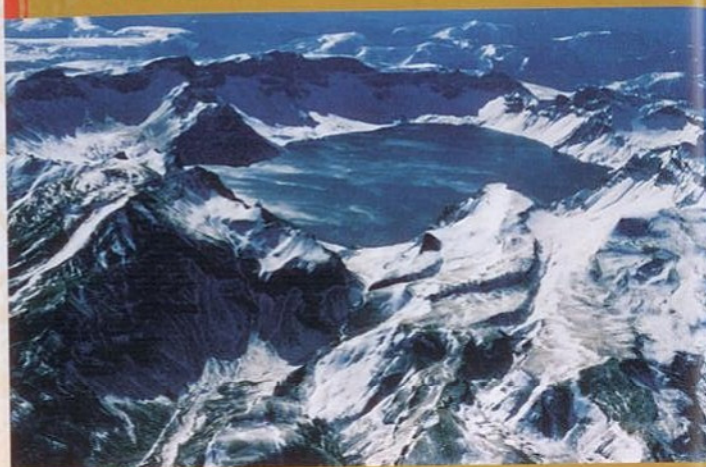
Tianchi Lake in the Changbai Mountains