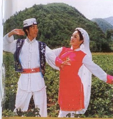
Young Hui people

Transport: It can be reached by regular buses to Shahu Lake from Tourist Bus Station in Beiguan.