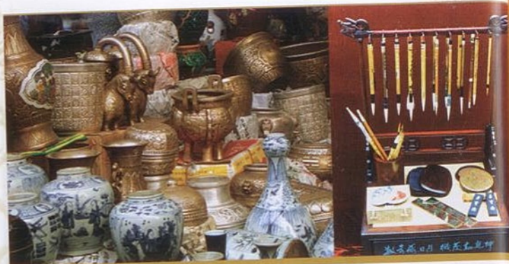
Exquisite arts and crafts