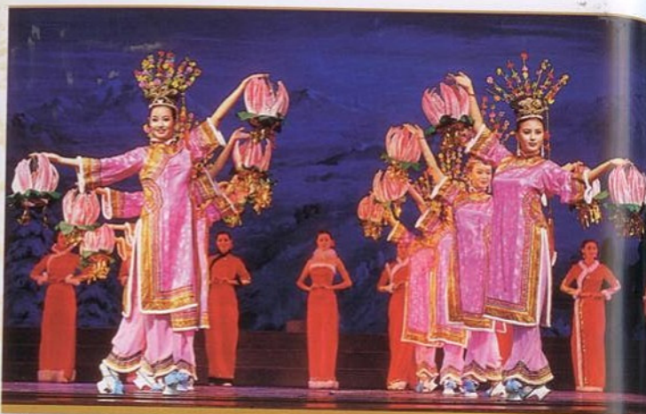
Folk songs and dances

by dolphins, sea lions and seals. In addition, there are shark room and marine fish hall as well as diving performances and exhibitions of rare marine products and performances by the Sea World Art Troupe.