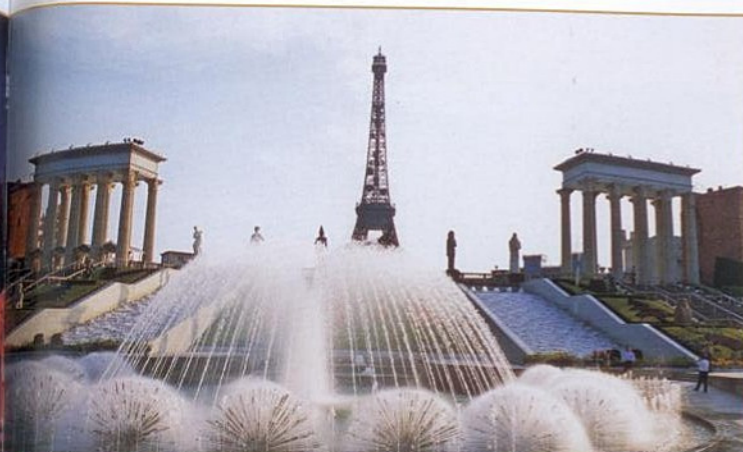
Window of the World

"Minsk" was the second generation of the multi-function medium-sized aircraft carrier of the former Soviet Union. It was manufactured in 1972 and joined the Pacific Fleet in 1978. It was the