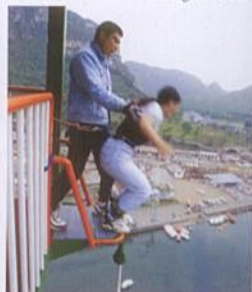
Bungee at Badu

2) Those car drivers may go from Liuliqiao to the Beijing-Shijiazhuang Expressway, get