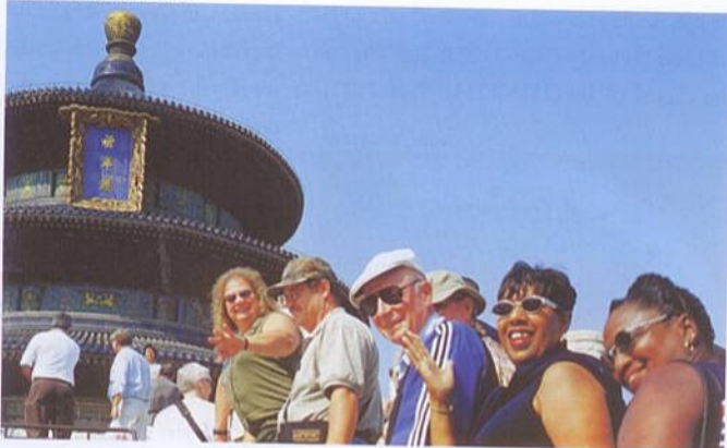
Visit the Temple of Heaven

Over the past two decades or so, Beijing has developed rapidly, and become a modern metropolis well known in the world. The coming Beijing 2008 Olympic Games is adding boundless opportunities and vitalities to the ancient city. Beijing is welcoming friends from all over the world with its special features of an ancient capital and modern style.