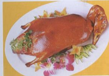
Beijing Roast Duck

1368), Ming (1368-1644) and Qing (1644-1911) dynasties, totaling 800 years. Therefore this ancient capital in the East boasts a great number of places of scenic and historic interest, which enjoy a high reputation in the world because of their large sizes and outstanding positions, such as the Palace Museum, the largest complex of palace buildings in the world; the Great Wall, known as one of the eight major scenic wonders in the world; the Temple of Heaven, the largest temple for worshipping Heaven in the world; the Ming Tombs, the densest imperial mausoleums in the world; and the Summer Palace, the largest imperial garden in the world. Like sparkling stars, they are the embodiments of ancient Chinese culture and the nation's feelings, nurturing Beijing's