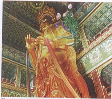
The giant Buddha at the Yonghe Lamasery

Beijing is a world-renowned tourist city, and its tourist corresponding facilities are