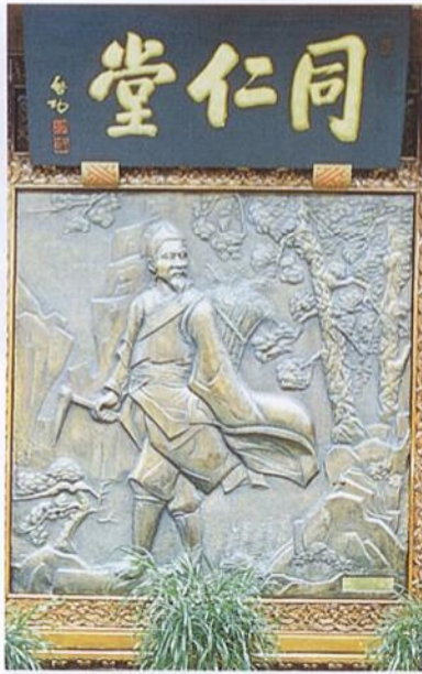
The shop sign of Tongrentang Pharmacy