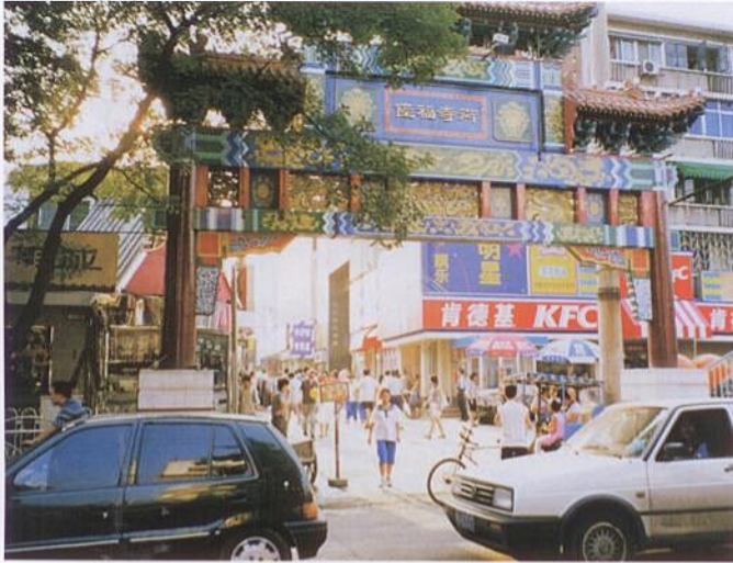
Longfusi Shopping Street