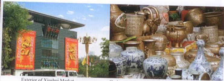
Exterior of Xiushui Market