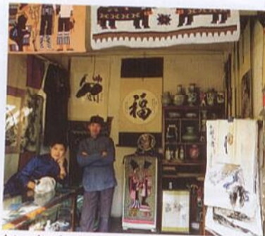
Arts and crafts

If you have limited time to stay in Beijing, the Friendship Store is a one-stop place to buy gifts to take back. Here you can buy all kinds of traditional Chinese crafts and goods, such as textiles, hand-made carpets, folk crafts, the four treasures of the study (writing brush, ink stick, ink slab and paper), etc. All the shop assistants in the Friendship Store offer good service and can speak several foreign languages.