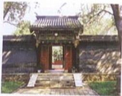
The gate of a quadrangle in Beijing