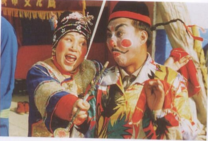
A folk opera performance at a temple fair

always bustling with peddlers from all over the city selling a variety of snacks, goods, toys and candies, in addition to theatrical performances. An old saying goes: "At the temple fair, girls want flowers, boys prefer firecrackers, old ladies like cotton padded shoes, and old men want new felt hats." The temple fair is jam-packed with people coming and going all the time, full of the jubilant festival atmosphere.