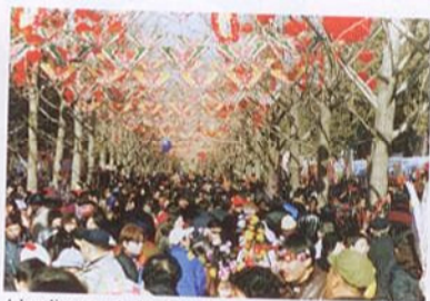
A bustling temple fair in Beijing

The temple fair in Beijing is a traditional public gathering for the New Year celebration, integrating foods, drinks and performances. The temple fairs originated from the areas near the temple, hence the name. Most of the temple fairs in Beijing are organized around the Spring Festival, and attract numerous visitors with various kinds of folk artistic performances, local snacks and folk arts and crafts. The people participate in various kinds of folk activities at the temple fair, such as yangge dance, walking on stilts, riding a land boat (a model boat