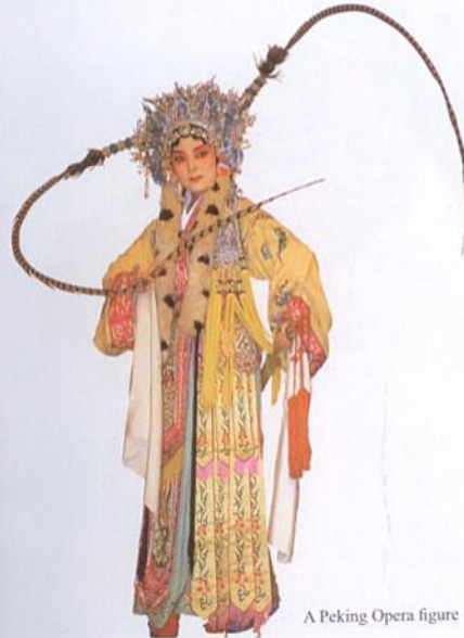
A Peking Opera figure

It is a closed residence, with only one door facing the street. When the door is closed, the family can fully enjoy its privacy, as well as the natural scenery.