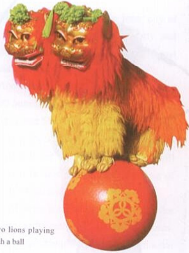
Two lions playing with a ball

The temple fair mainly displays Beijing's local customs. The Spring Festival temple fairs in Beijing are